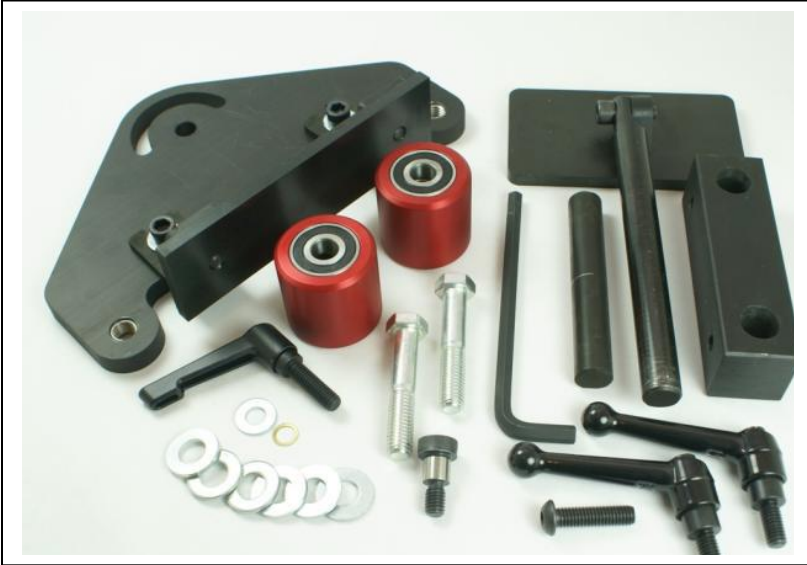
Photo 1 Shows what the box should contain if you purchased a Flat platen and a Toolrest

Step one: Attach the two 2" Wheels to the Flat Platen using the included \frac{1}{2} x 13 x 2.750" hex Bolts . You will need 4 ea - \frac{1}{2} Washers per Bolt . Place none under the head of the Bolt and four between the Wheel and the Flat Platen (see Photo 2). Tighten the Bolt using a \frac{3}{4} wrench. Attach the Flat Platen to the 15" Tooling Arm using a 3/8-16 Shoulder Bolt and ensure No brass Washer is on the threads of the Shoulder Bolt . Tighten the Platen tightly, if it does not move freely, add the First brass washer so when shoulder bolt is tight platen rotates freely. If still tight add second washer Finally, place the 3/8 - 16 Adjustable Handle in the arc slot of the Flat Platen as seen in Photo 3.